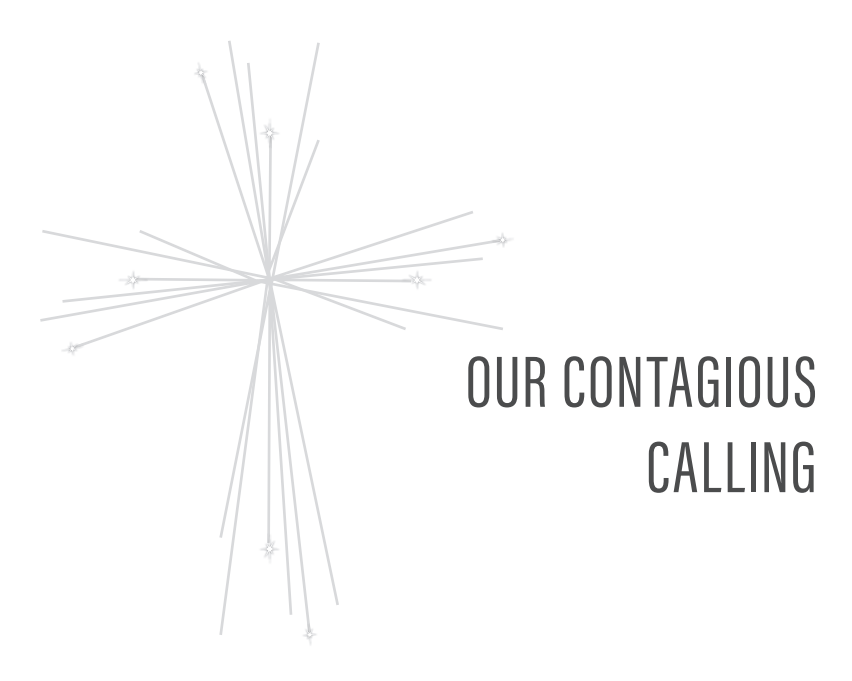
"We were meant to live for so much more . . ."

So declares the popular Switchfoot song, Meant to Live . The lyrics echo what we are told both by our hearts and God's Word—we really were made to live for greater purposes.